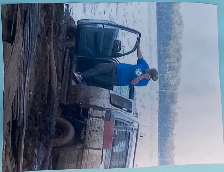
They were stuck for 7 hours