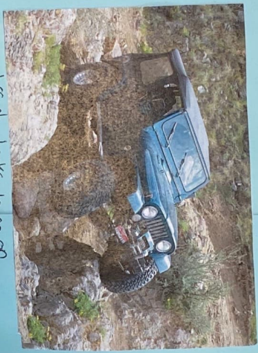
Many different tracks to go on - Sand - mud - Rock - water - Snow